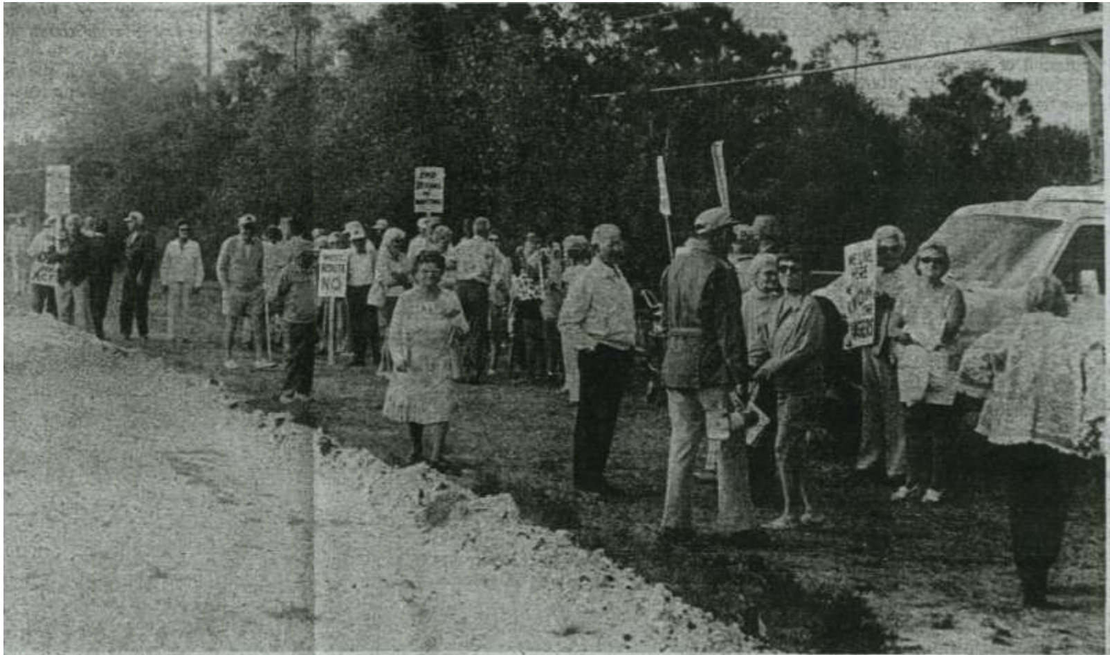
Residents march demanding U.S. 41 be four-laned now.